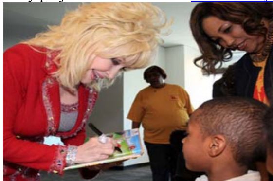
Collaborative relationship between Rotary International and the Dollywood Foundation's Imagination Library

Beyond clean water and health, RI places a priority on literacy , unfortunately a significant problem in our own Georgia communities, which in many cases have higher illiteracy rates than do provinces in countries such as India. Rotary Districts in Georgia and nearby states (e.g. South Carolina, Tennessee) are partnering with the Ferst Foundation for Childhood Literacy so that Rotarians can sponsor the delivery of 12 books a year for a child between birth and age 5 at a cost of $36 per student per year. With books mailed directly to the child, this program has demonstrated that it significantly increases the readiness of Georgia children to succeed in school when otherwise they would begin and likely never shed their handicap of limited vocabulary and reading ability. Links to the literacy projects are available at www.RotaryDistrict6920.net