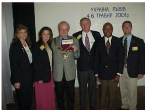
6920 GSE Team in Ukraine